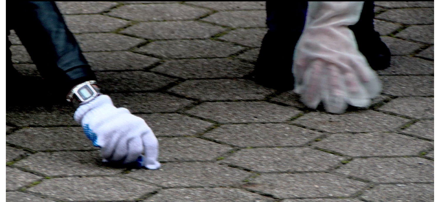
Video from Gnatte movement July 2024 https://youtu.be/DNdlHnLkpJk